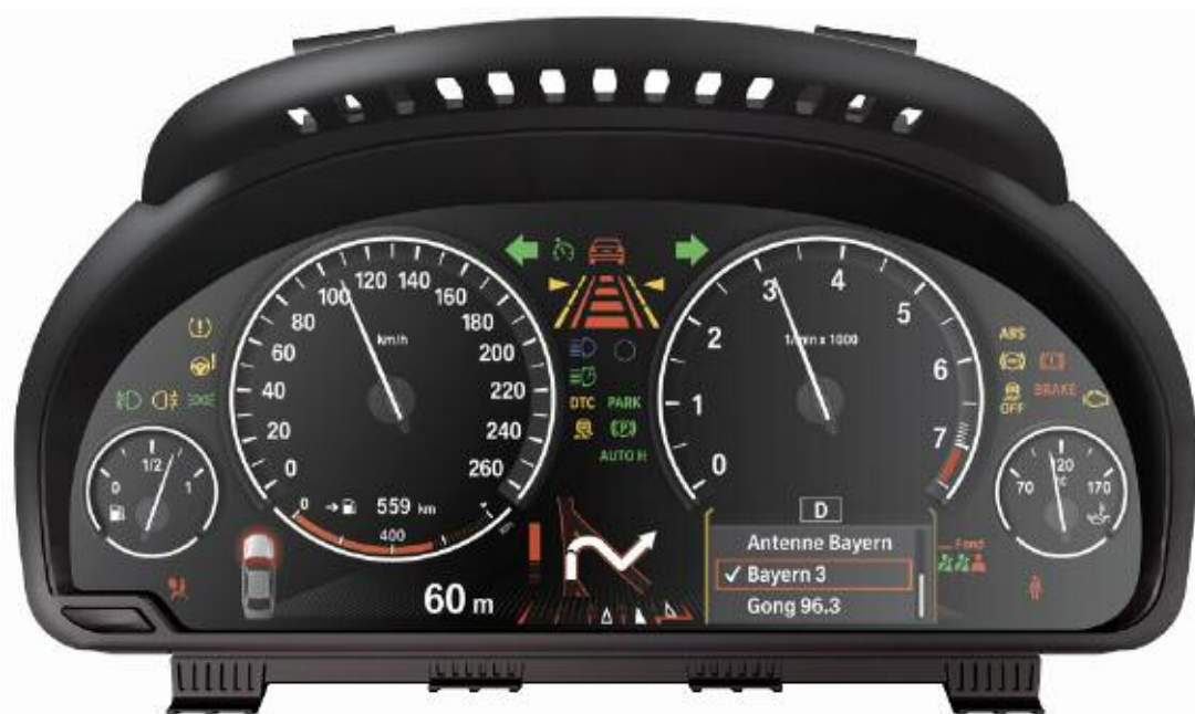
BMW 7 Series instrument cluster

The display for the Entertainment mode is located on the right-hand side of the display; the Navigation display is in the center; and the display for Check Control messages is on the left.